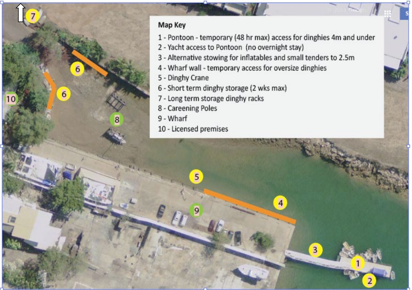
ATTACHMENT A - Area Map